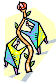
Academic Advising branches out to help students