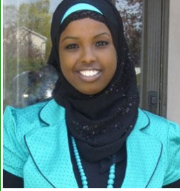
NLA Alumni and Girl Scouts of Washtenaw Membership Specialist