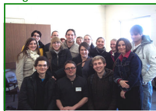
Students from Kehl University with EMU and NLA students

Leaving 12 degree Michigan weather for sunny Santa Barbara, CA