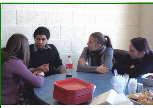
Sharing thoughts at lunch

Students from Kehl University (Hochschule für öffentliche Verwaltung Kehl) in Germany met with NLA students and EMU Student Government representatives in February to talk about student life in America, student activities and community engagement. At a lunch sponsored by the Political Science Department, the visitors shared thoughts on cultural differences and politics.