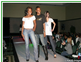
AH Fashion Show 2009

Welcome to the Fall issues of our newsletter! We had a great but busy semester so far and many things to let you know about.