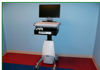
GO-Kart allows bed-ridden children to play games

GOF has three primary initiatives: Project GO-Kart , Fun for our Troops and Gaming 4 Others .