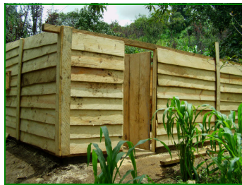
"Building homes for children is one most rewarding experiences of my life."