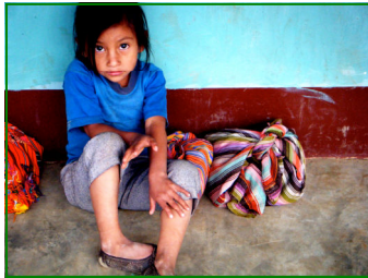
Waiting at the food program

We were able to build five houses for widows and their children