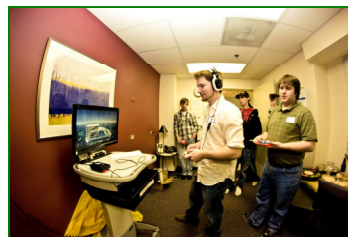
A group plays on GO-Kart

Gaming 4 Others hosts online tournaments for a variety of causes and charitable events. Online tour-