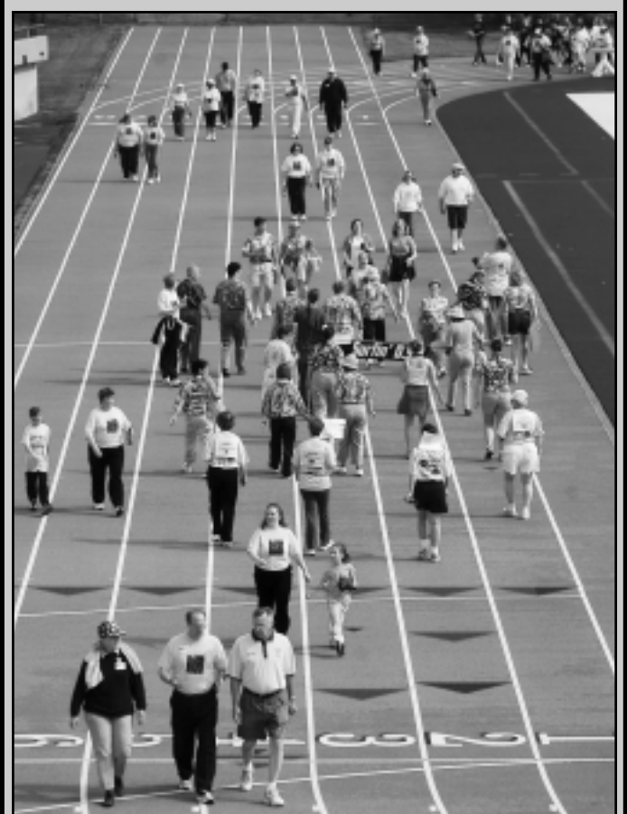
PUT ONE FOOT IN FRONT OF THE OTHER: Eastern Michigan University's Walk For Women's Athletics raised $32,000 for athletics scholarships, specifically for women athletes who need fifth-year aid. The May 10 event, which took place at Rynearson Stadium and the Convocation Center, attracted 340 walkers and nine major community sponsors.