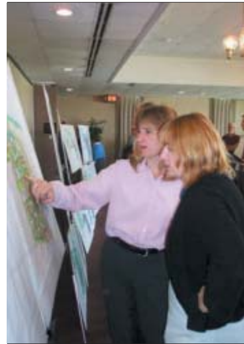
A MASTER LOOK: Members of the EMU community and neighborhood residents gathered at two meetings Sept. 18 to discuss and respond to the preliminary EMU Campus Master Plan.