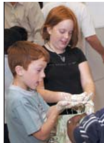
SLIME TIME: These children enjoy making slime at the "Saturday in the Lab" in Mark Jefferson during last year's Family Day.

up a passport at any of the following activity buildings: McKenny Union, Sill Hall, the Marshall Building, Snow