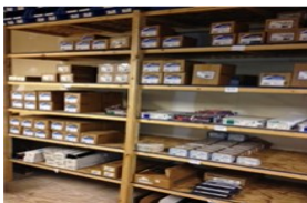
New ballast racking system sorted by type