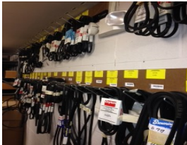
New belt inventory room labeled & in WEBTMA.