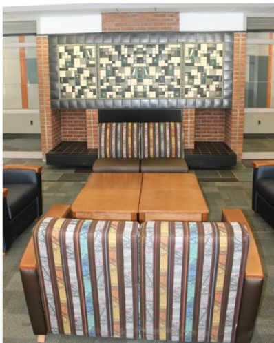
Best Hall Lounge Fireplace