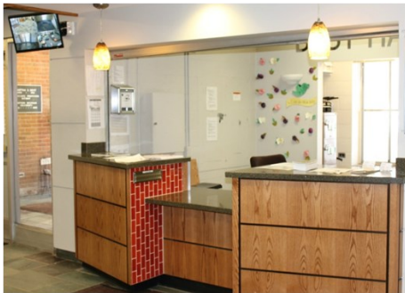
Best Hall Front Desk