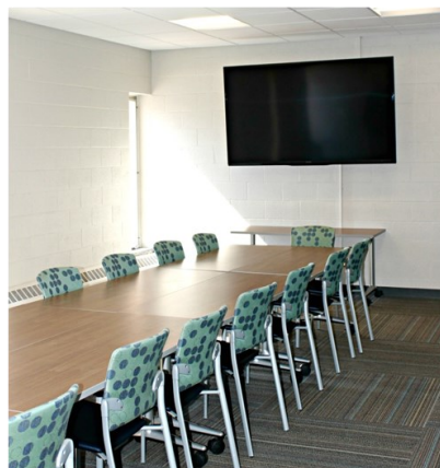
Best Hall Conference Room

“Everything we hear is an opinion, not a fact. Everything we see is a perspective, not the truth.” -Marcus Aurelius