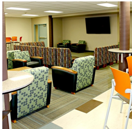
Best Hall Multipurpose Room