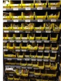
Plumbing room 3 with finished barcodes BARAD (PL3-1000)