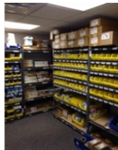
Plumbing room 2 is labeled & organized.

"A smart man makes a mistake, learns from it, and never makes that mistake again. But a wise man finds a smart man and learns from him how to avoid the mistake altogether." -Roy H. Williams