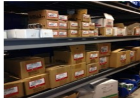
Rack for all the B&G Parts: Motors, power packs, bearings, & sleeve kits.