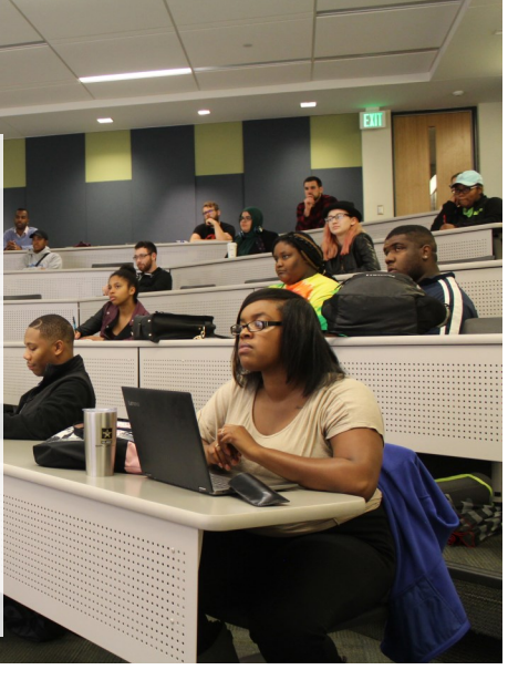
What is Public Administration? Event