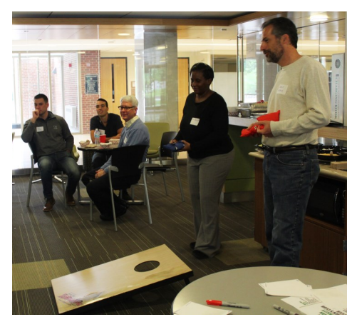
Faculty and students enjoyed playing cornhole at the new student orientation.

Besides the official program of the orientation, the event also offered fun activities that helped to break away nervousness and initial shyness. The fun afternoon was enriched by a delicious lunch that made everyone full and satisfied that even the rainy weather did not matter anymore.