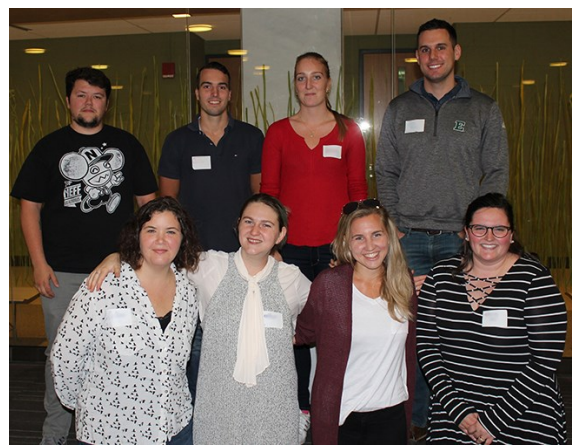
Students at the New Student Orientation