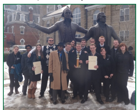
Mock Trial team at Washington and Jefferson University

On February 10th, 2013, EMU won the AMTA regional tournament. This victory capped a two-year run that placed EMU in the top three at 9 different tournaments. Individual students have also won numerous top-ten attorney and witness awards. This spring the team says goodbye to three veteran