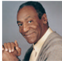
Bill Cosby Opening General Session

The 2005 Annual SHRM Conference will be held June 19 – 22 in sunny San Diego, CA. As always the conference will include a variety of activities, presentations and networking opportunities.