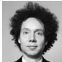
Malcolm Gladwell General Session