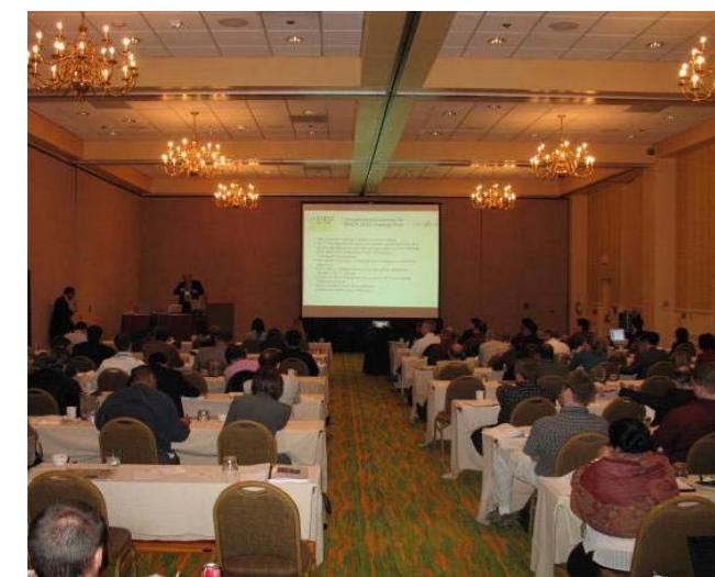
Smart Coatings 2008