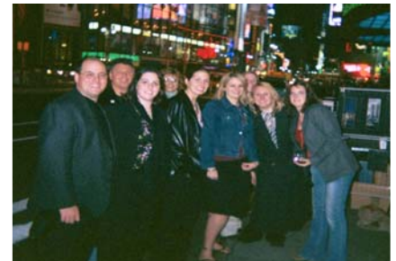
Members of PRSSA in Times Square at the PRSSA National Conference

obtain more experience for members and to create awareness for PRSSA, many partnerships were formed on campus. Organizations included: the NAACP, the housing-affiliated Student Success Office, the political science department and the study abroad office. PRSSA members worked with these organizations and departments to hold press conferences, write promotional material and create general awareness.