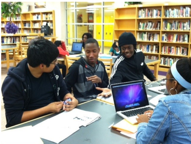
Students taking a snack break during College Club