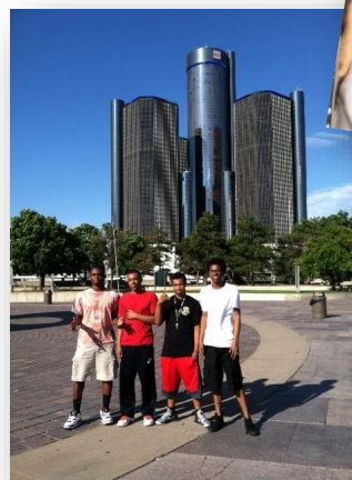
Students pause along the Detroit River Walk for a photo in front of the Renaissance Center.