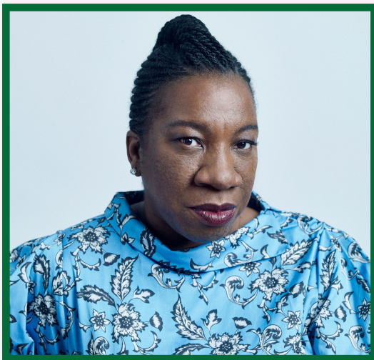
Keynote speaker and #MeToo movement founder Tarana Burke (left).