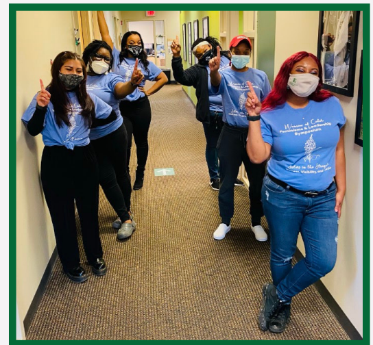
Some of the EMU students who helped host the virtual event (right)

CLICK THE IMAGES BELOW TO STAY UP TO DATE WITH THE EMU WOMEN'S AND GENDER STUDIES DEPARTMENT