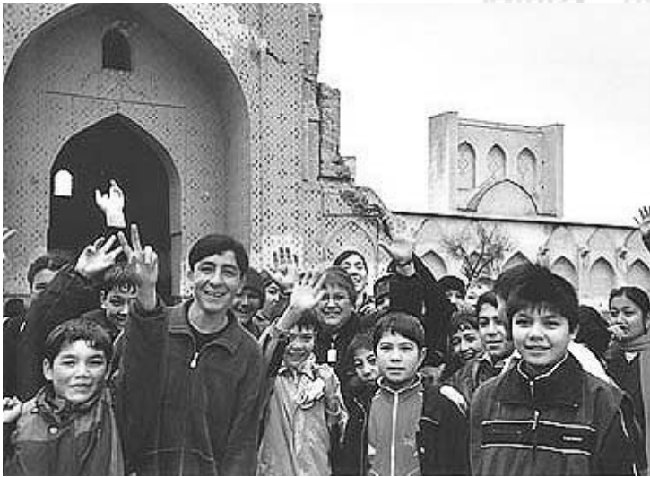
School children in Samarkand, Uzbekistan.

In January 2002, in keeping with my position in the Office of Research Development, I submitted a proposal to IREX, a U.S. State Department contractor, offering EMU as a host institution for stu-