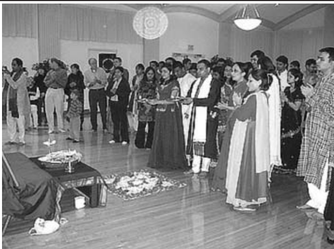
A ceremony of light to celebrate Diwali

EMU celebrated Diwali, the Indian Festival of Lights, November 1, 2003 with Diwali Dandiya Dance Nite in the McKenny Union Ballroom. Dandiya dancing and a lighting ceremony were part of the night's events to celebrate the Hindu New Year.