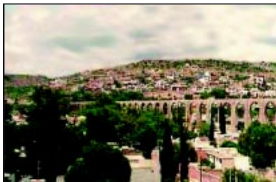
HISTORICAL QUÉRETARO: Eastern Michigan University students are taught Spanish in the city of Querétaro (above) as part of the EMU Spanish Intensive Language Program.