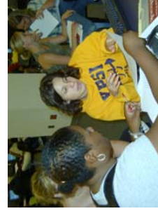
Write-Link students working together during 2006 program.