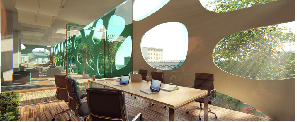
Senior Year - Studio Adaptive Reuse Design