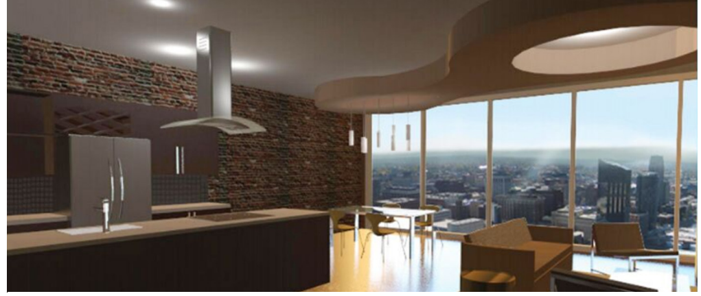
Sophomore Year - Studio Residential Design