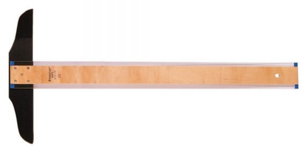
24" T-Square optional (~$20)