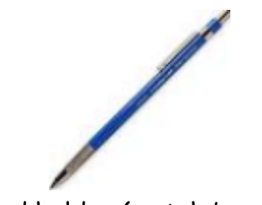
9. Lead holder (match brand with pointer and drafting leads) (~$10) Not a mechanical pencil.