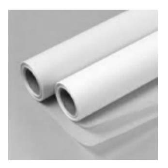
2. Roll of 24" white drafting tissue (~$18) (i.e., trash paper, onion skin, or bum wad)

5. Erasing shield (with series of circles) (~$6)