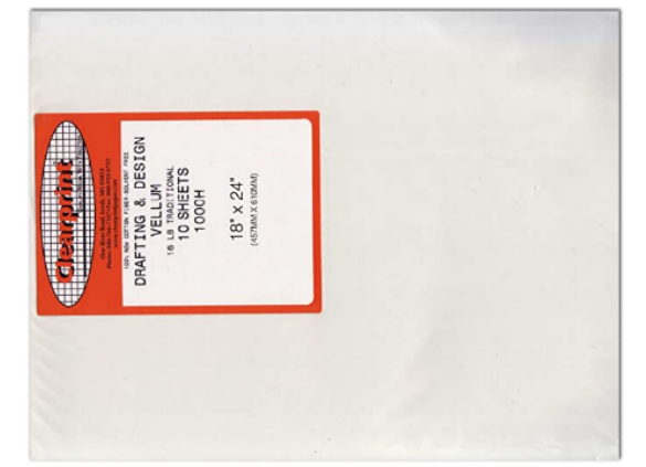
15. Vellum sheets (8-10 sheets needed for Studio 1) (~$32) (18" x 24" no title block)

14. Pad of vellum (10-12 sheets needed for Studio 1) (8-\frac{1}{2} " x11" no title block) (~$11)