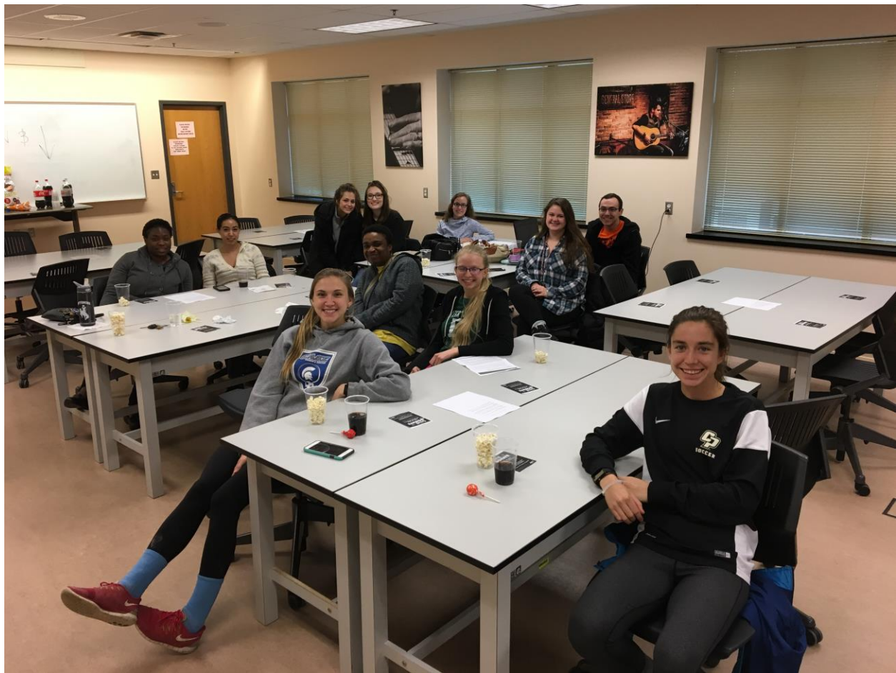
In March 2017 PTE members collaborated with EMU Special Olympics and Best Buddies to host a viewing of the film "The Family Next Door," about the experiences of a family with children on the Autism Spectrum and facilitate a roundtable discussion.