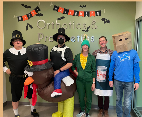
2nd year B group: Christmas