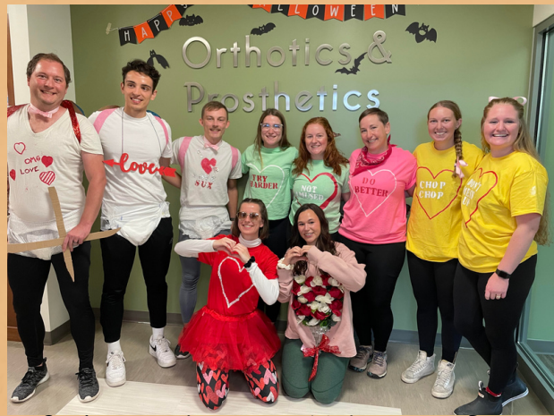
2nd year A group: Valentines Day

This years theme was Holidays and everyone put in so much effort!