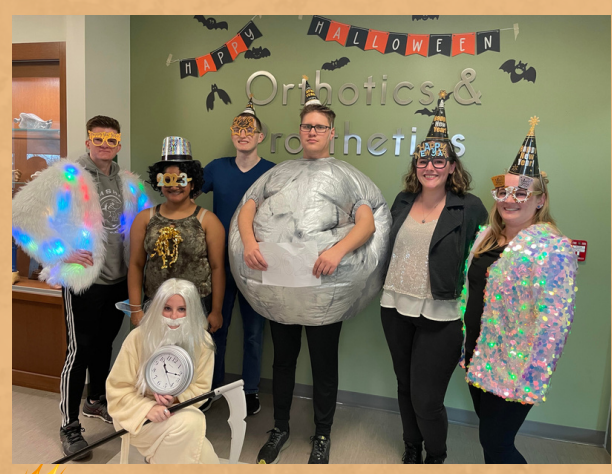
lst year A group: New Years Eve