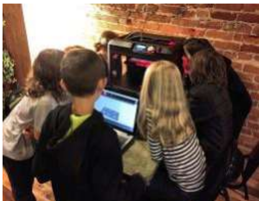
Children learning to use the 3-D printer