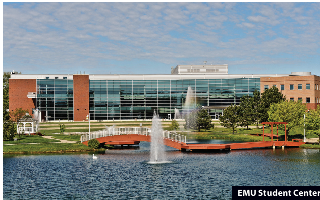
EMU Student Center

For information about admissions and graduate teaching/research assistantships, contact the Economics Department 734.487.3395 and Mathematics Department 734.487.1444.