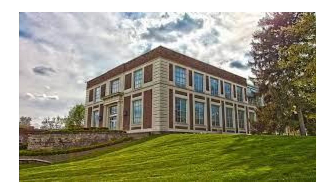
Graduate Research and Creative Activity Conference Webpage