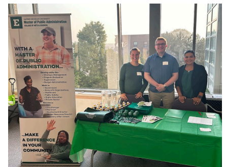
MPA students assist with the public safety workshop.