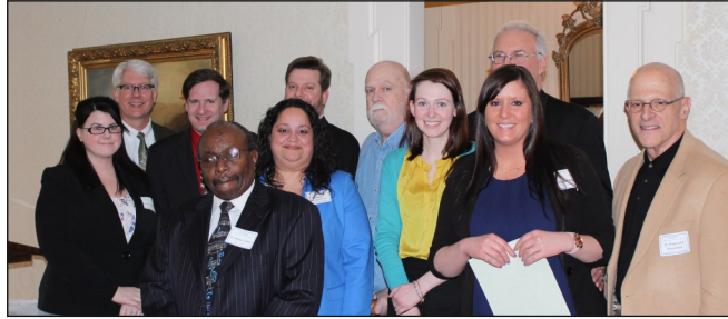
This year's Pi Alpha Alpha inductees pictured above with MPA Faculty.