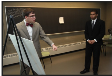
Mock Trial in Action