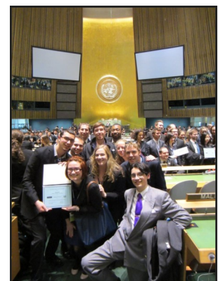
EMU Suriname Delegation

at the American Model United Nations conference in Chicago.