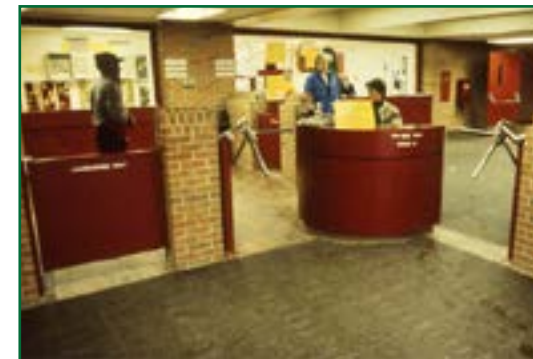
REC/IM MEMBERSHIP DESK, 1982

To be eligible to participate in the Rec/IM programs and services, an individual must have a current Eastern Michigan University Rec/IM membership. EMU students have the option to pay the Rec/IM fee for this privilege. This fee was proposed and advocated by Student Government to support the renovation of the Rec/IM Building. All other individuals must purchase a Rec/IM membership to access the facilities.