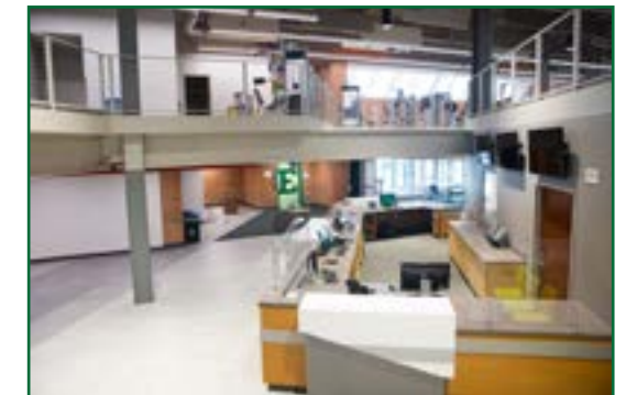
REC/IM MEMBERSHIP DESK, 2020

Every patron must show picture identification to enter the building (i.e., valid EMU student ID, current Rec/IM membership card, driver's license with membership receipt/guest pass/forgotten ID pass) and be able to provide it if asked while in the building. If student privilege is unable to be verified through the University, students will be asked to provide staff with their current (live) weekly schedule and proof of having paid the Rec/IM fee on their emich ebill, which is only allowed the first two weeks of the semester. Children under 18, who do not have picture identification, must show their Rec/IM membership receipt until their permanent membership card is available for use. In addition, children under 18 must be accompanied by a parent/legal guardian that is also a current Rec/IM member at all times. Rec/IM membership cards are not transferable.