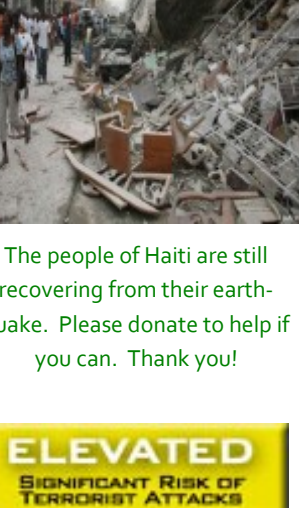
The people of Haiti are still recovering from their earthquake. Please donate to help if you can. Thank you!

Please let us know if we overlooked something.