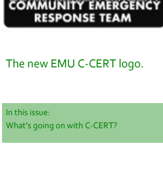
The new EMU C-CERT logo.

As part of the Emergency Management Offices' goal of keeping all of our C-CERT members involved and informed we are now producing a bi-monthly newsletter highlighting upcoming events, awesome CERT news, events on campus, what other CERTS' are doing around the world, and even some humor! What's the name of this newsletter you may ask? The C-CERT Responder. We welcome any input about this newsletter and you are more than welcome to submit articles too! Wow, this thing is great. We hope this newsletter will allow you to keep on track with C-CERT and improve your response skills. We also are open to you forwarding it on to anyone you think might be interested. Thanks and enjoy!